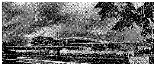
Ground Breaking Ceremonies Beth-El Temple and Center July 10, 1955