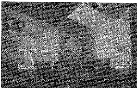
Our Sanctuary, 1966